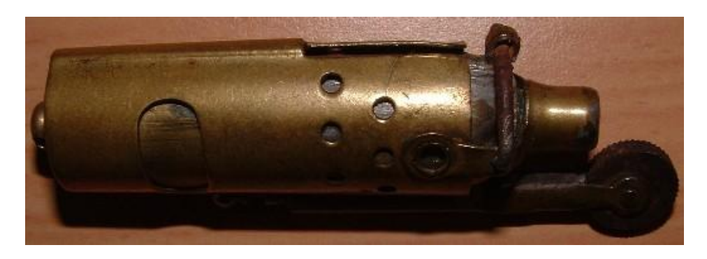
"WENTY'S" TRENCH MADE LIGHTER