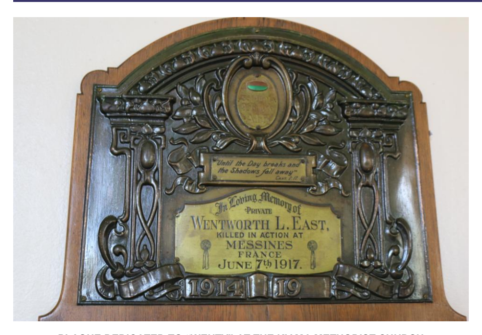
PLAQUE DEDICATED TO "WENTY" AT THE KIAMA METHODIST CHURCH

On 7 October 1933, a window in honour of Wenty was unveiled in the Kiama Methodist Church.